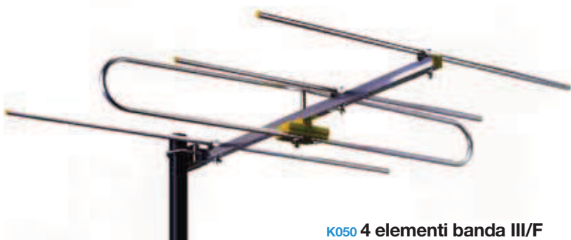
K050 4 elementi banda III/F