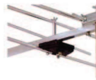
Scatola dipolo impermeabile Waterproof dipole box