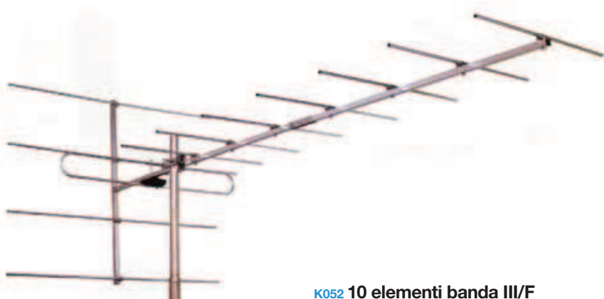
K052 10 elementi banda III/F