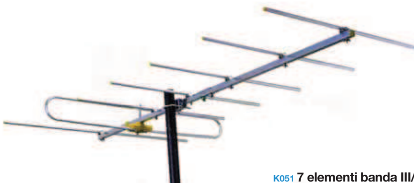
K051 7 elementi banda III/F